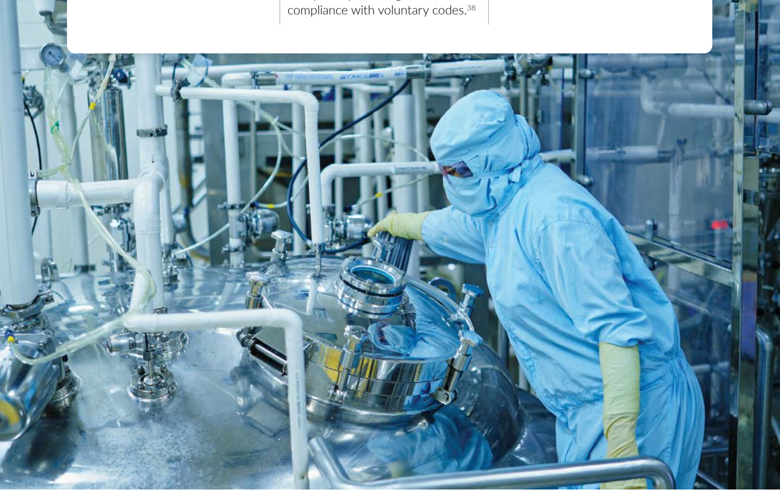
<sup>36</sup>GRI 3-3, <sup>37</sup>GRI 417-1, <sup>38</sup>GRI 417-2, GRI 417-3

We adhere to a well-established disposal process for the safe disposal of returned or recalled products as per local rules governing safety and environmental protection. We strictly abide by applicable laws and ensure that we meet the established standards for requirements unique to a given geography. Additionally, we document the identification method of product quantity and destruction date.